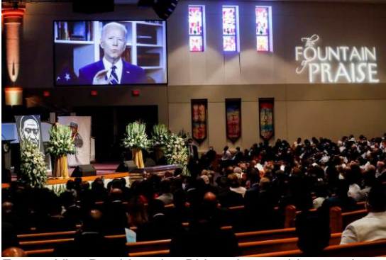
Former Vice President Joe Biden gives a videotaped message at the funeral for George Floyd on June 9, 2020 in Houston.

President Trump has actively undermined progress on all these issues, including suspending the Obama-Biden administration's rule on Affirmatively Furthering Fair Housing, which required communities to proactively examine housing patterns and identify and address policies that have a discriminatory effect.