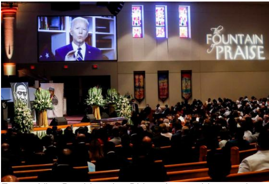
Former Vice President Joe Biden gives a videotaped message at the funeral for George Floyd on June 9, 2020 in Houston.

President Trump has actively undermined progress on all these issues, including suspending the Obama-Biden administration's rule on Affirmatively Furthering Fair Housing, which required communities to proactively examine housing patterns and identify and address policies that have a discriminatory effect.